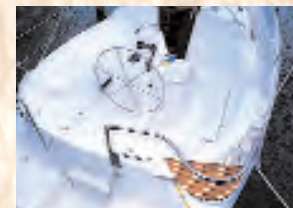
The rounded cockpit is pushed right to the gunnels to provide maximum useable space.