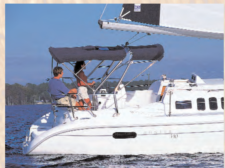
The integrated arch keeps the cockpit clear with the traveler up top and makes a great attachment point for the optional bimini.