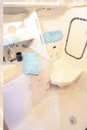
The covered marine head doubles as a shower seat in the enlarged head. Corian® counters and plenty of dry storage is a must.