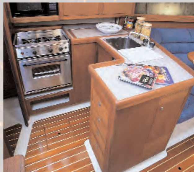
The full service galley is U-shaped and Corian®-covered for beauty and durability. A hidden trash bin, full range with oven, microwave, and large icebox is all standard; a Chef's Delight!