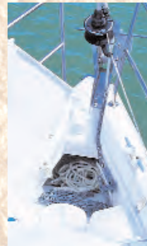
The stainless steel anchor roller leads into a deep well that can handle all the chain and rode you need.