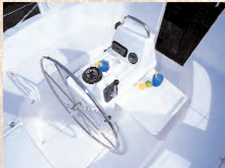
Custom consoles provide added space for for instruments and the drop leaf table is perfect for entertaining.