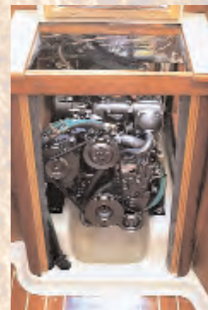
Access to the 27 horsepower freshwater-cooled Yanmar is excellent on all four sides. The insulation will keep it quiet and cool.