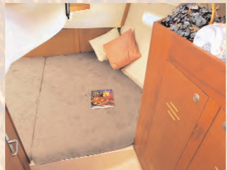
Headroom in the master stateroom is excellent. The queen-size berth is accompanied by two hanging lockers and plenty of stowage.