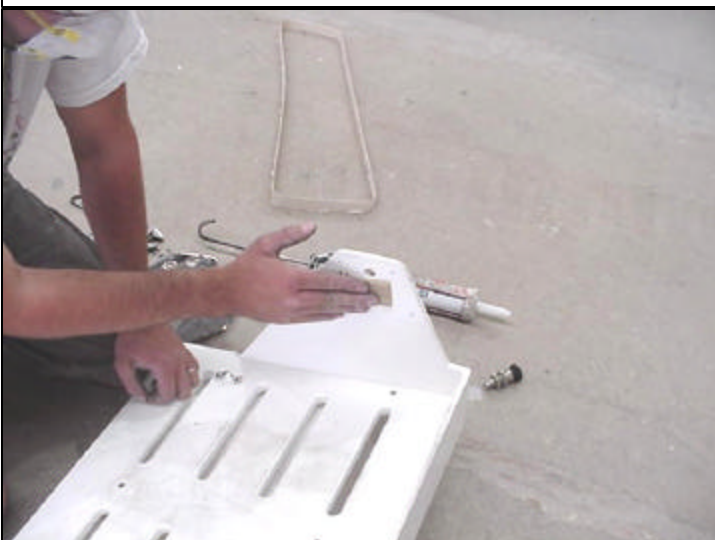
Sand inside the marked perimeter with 80 grit sandpaper.