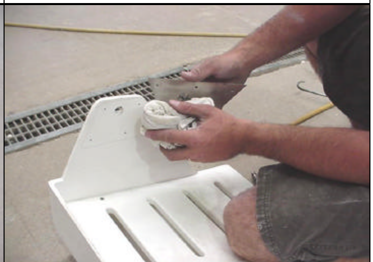
Clean the sanded area & the back of the reinforcement plate with soapy water then rinse well & dry.